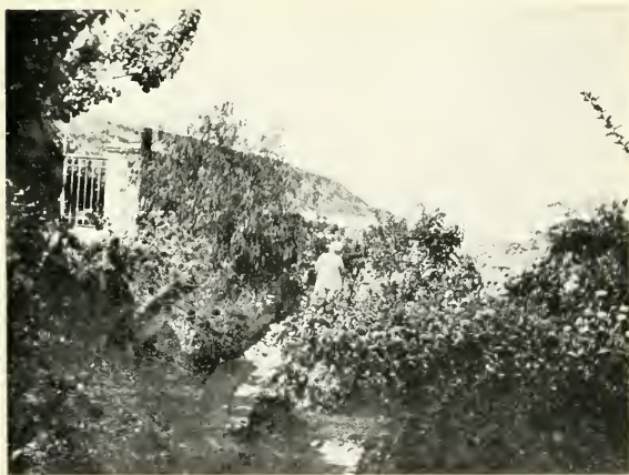
ABDUL BAHÁ WALKING IN HIS GARDEN IN HAIFA